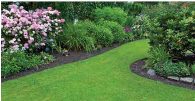
Monarch Blue Grass Blend.

"We work hard to source local and [international] products to our community," Stremmel explains.