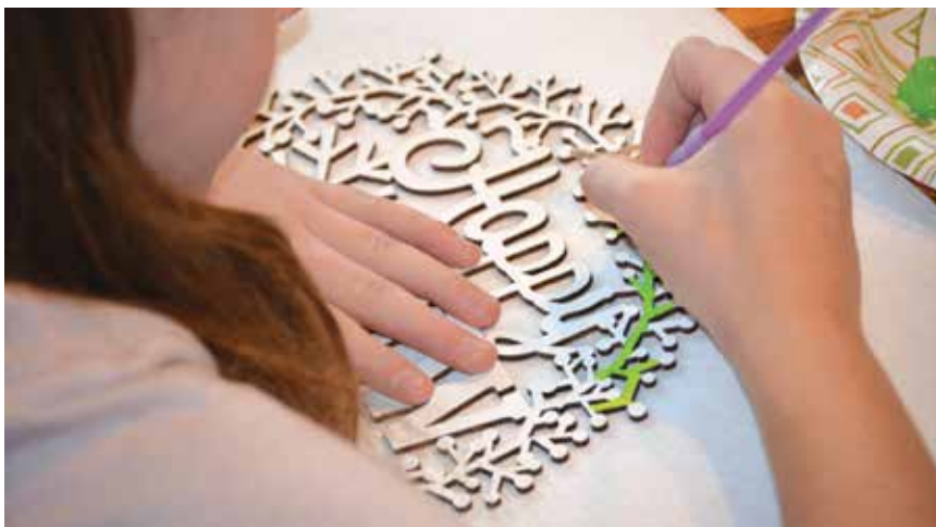
LDCmodern offers crafting classes and more