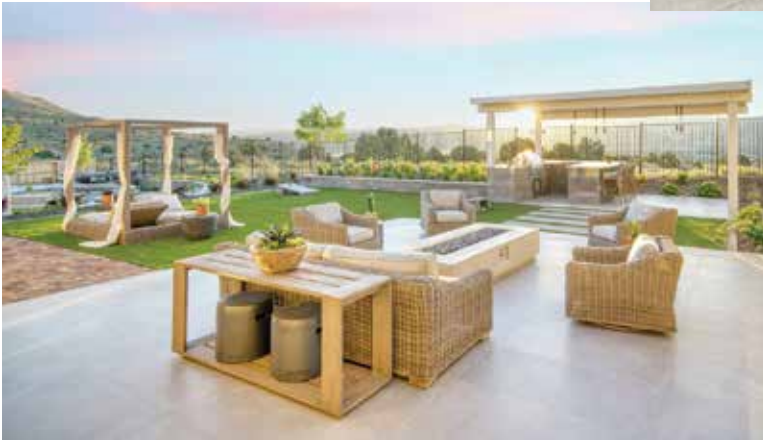
Cinnamon Ridge Caraway homesite backyard.

"Communities like Toll Brothers' Cinnamon Ridge and Harris Ranch in Sparks include large home sites, open-flow floor plans, and optional sliding glass doors that open up the great room to a generous, covered patio," explains Donna O'Connell, president of Toll Brothers' Reno division. "Numerous options are available to enhance your outdoor living areas, such as a primary-suite deck, RV parking, and detached casita with a kitchenette and full bath."