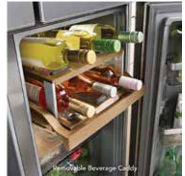
Kitchenaid 36" Counter-Depth 19.4 Cu Ft 4-Door Refrigerator with Flexible Temperature Zone in PrintShield™ Finish. Available at Sargent's Appliance Sales and Service Center in Sparks