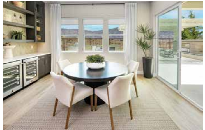
Harris Ranch