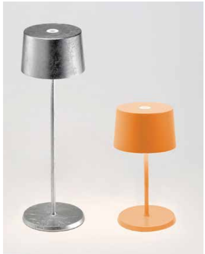
Zafferano cordless, rechargeable lights, Olivia collection. Available at LCDmodern.