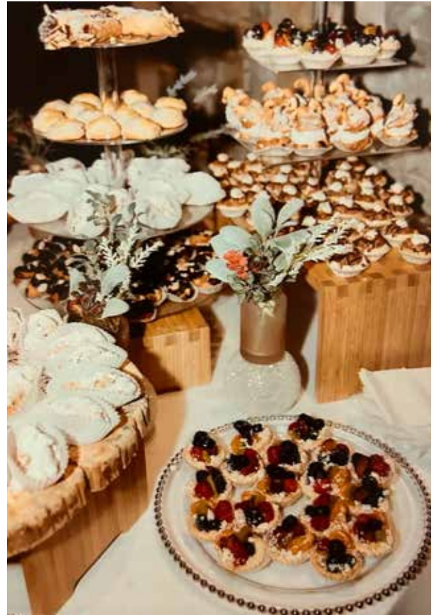
Sweet treats prepared by Dolce Caffé in Reno