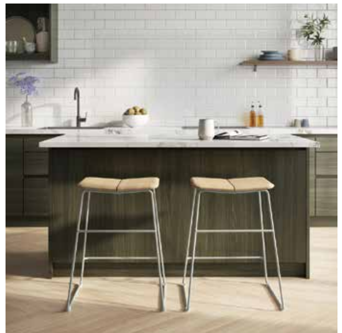
Aero Counter Stool - ash natural and sage.