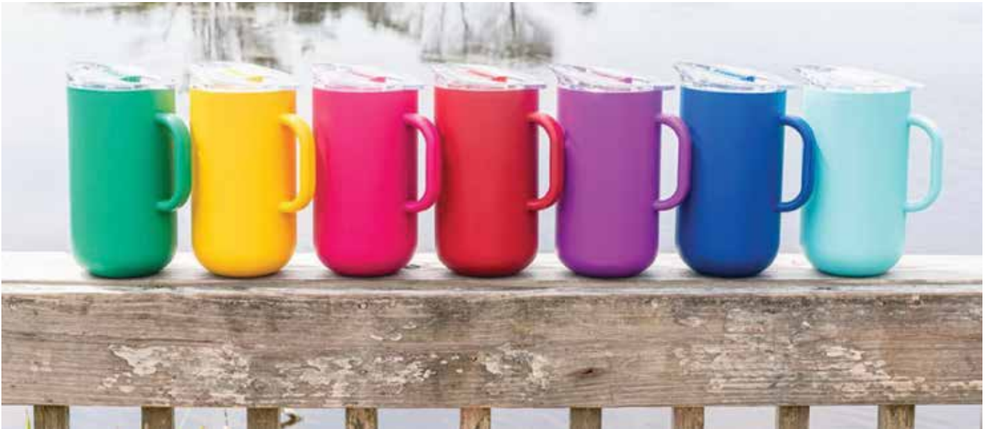
Served insulated pitchers are available at LCDmodern in Reno.