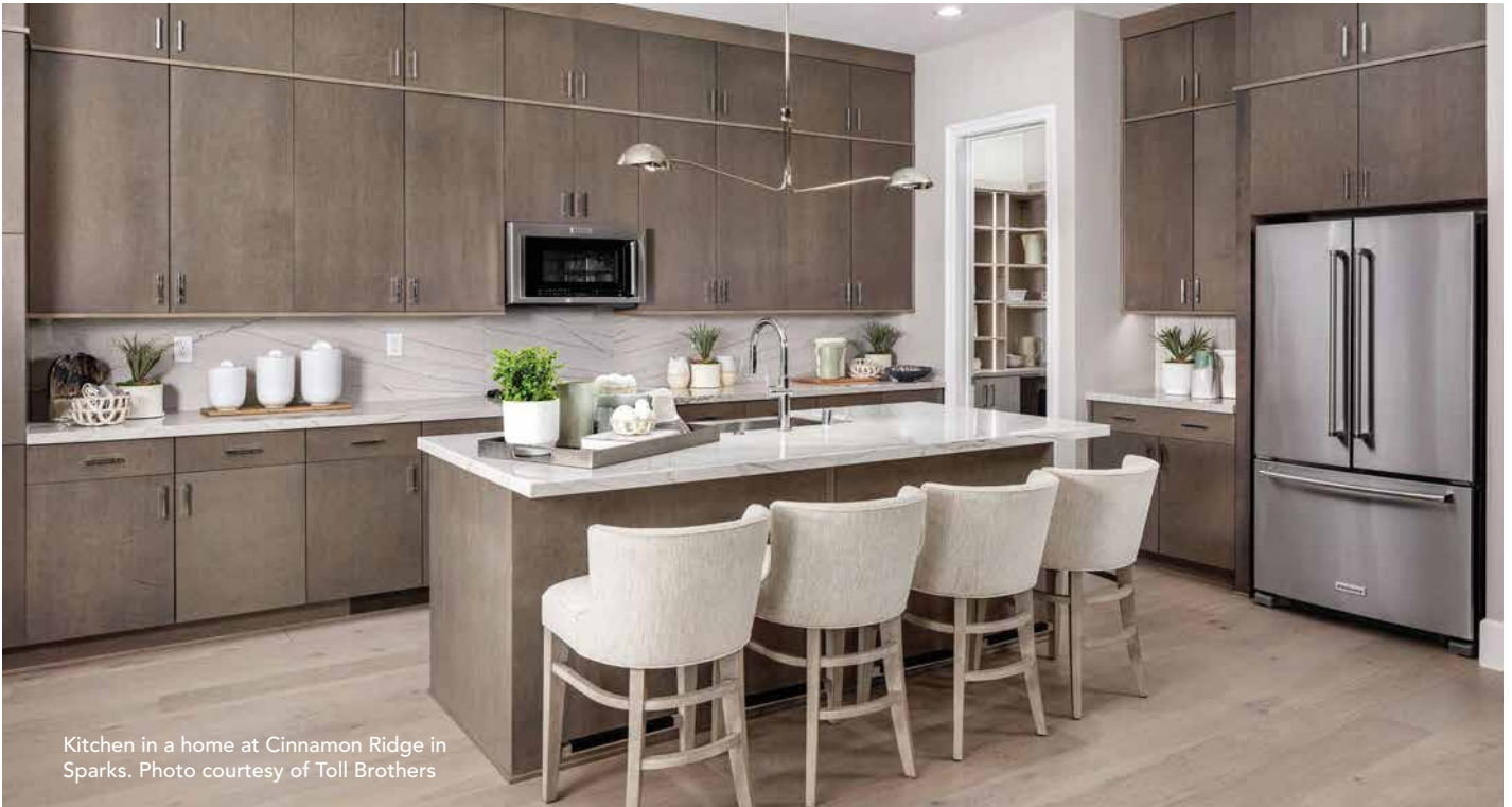
Kitchen in a home at Cinnamon Ridge in Sparks.