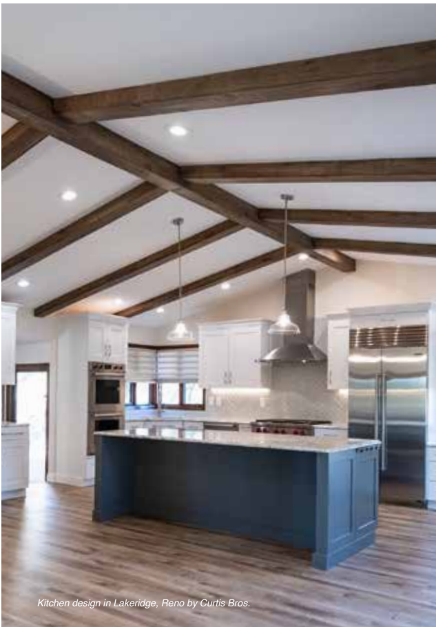
Kitchen design in Lakeridge, Reno by Curtis Bros.