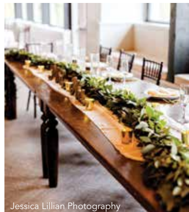
Jessica Lillian Photography