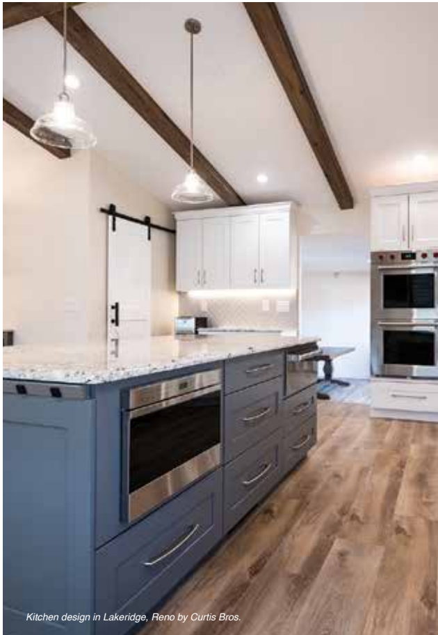
Kitchen design in Lakeridge, Reno by Curtis Bros.

"OUR GOAL? SOMETHING THAT LOOKS STRAIGHT OUT OF A MAGAZINE."