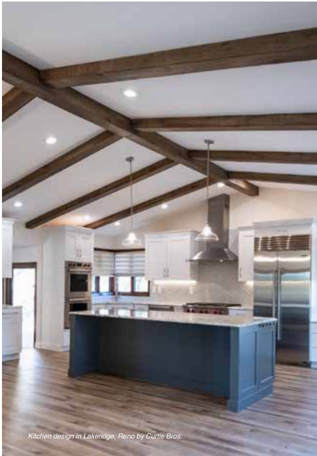
Kitchen design in Lakeridge, Reno by Curtis Bros.

"I WANT OUR DINNER PARTIES TO BE THE STUFF OF LEGEND."