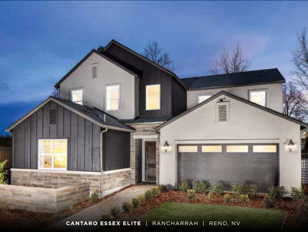
CANTARO ESSEX ELITE | RANCHARRAH | RENO, NV