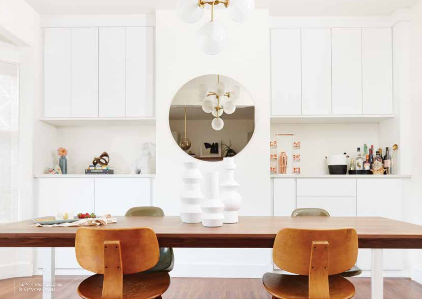
Pantry custom designed by California Closets